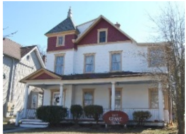
The Stephen Crane House, 508 Fourth Avenue